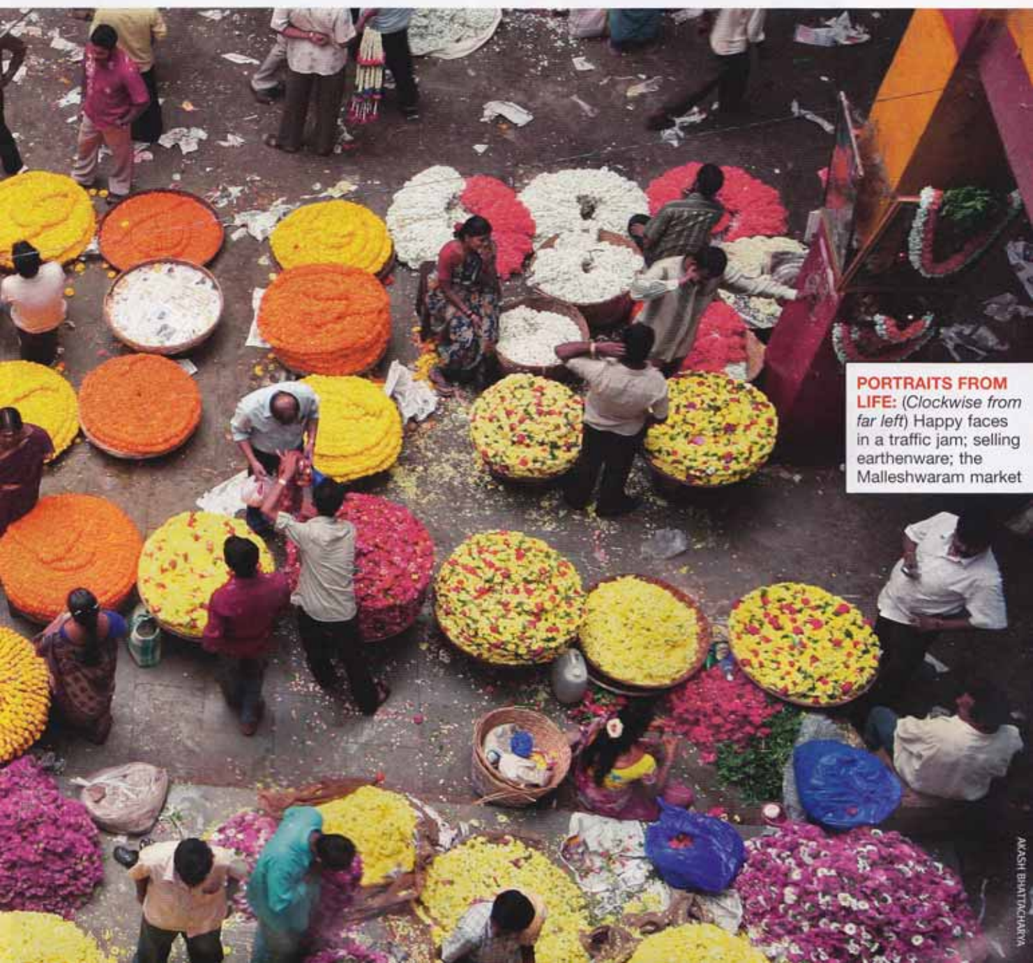
PORTRAITS FROM LIFE: (Clockwise from far left) Happy faces in a traffic jam; selling earthenware; the Malleshwaram market

I arrived at Malleshwaram, a flower and vegetable market, at that poetic time that is neither day nor night when the stalls' bright, happy wares were being artfully piled for sale